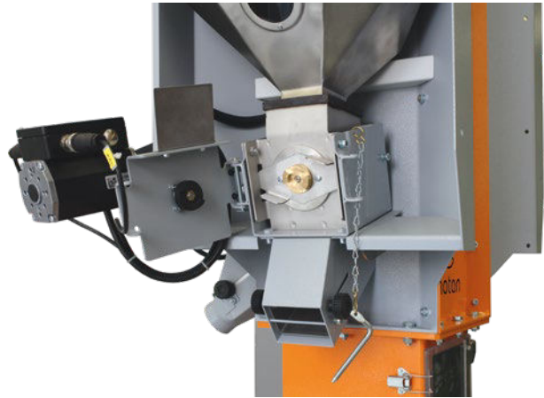
One-sided bearing mounted dosing screw with quick release connection