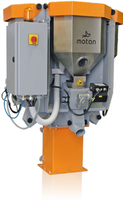
SPECTROCOLOR V with 10L collecting bin and three dosing modules