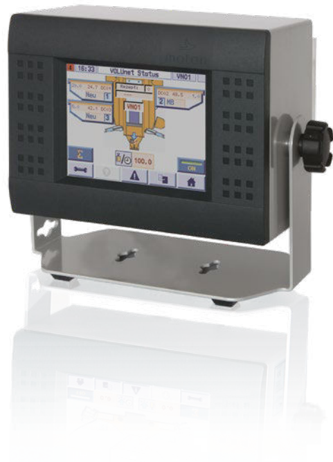
VOLUnet SC control

motan's unique gravity-mixing principle offers a high level of mix consistency of the components before they reach the extruder. This plays a key role in achieving perfect plasticisation and homogenisation of the materials.