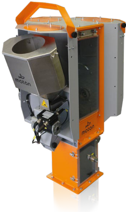
Quick change system